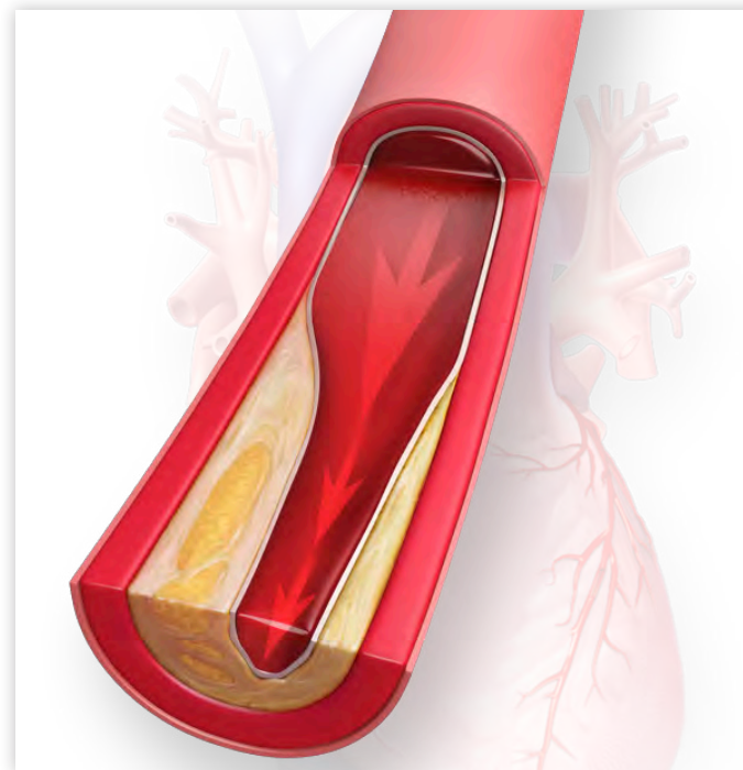
Cholesterol can join with fats and other substances in your blood to build up in the inner walls of your arteries. The arteries can become clogged and narrow, and blood flow is reduced.

Triglycerides are the most common type of fat in your body. They come from food, and your body also makes them. They can also build up within your artery walls and cause plaque.